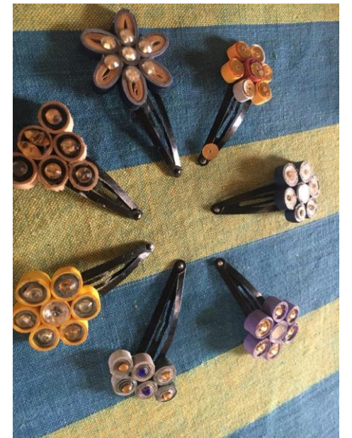
QUILLING HAIR PIN