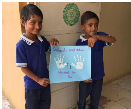
INT. PEACE DAY